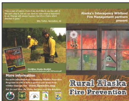
Rural Alaska Fire Prevention Brochure