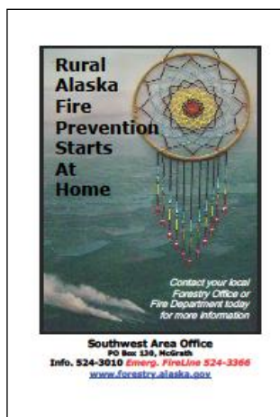
Rural Alaska Fire Prevention Magnets and Stickers