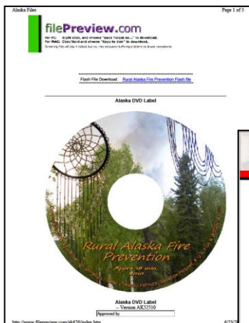
Rural Alaska Fire Prevention Video – 18 minutes