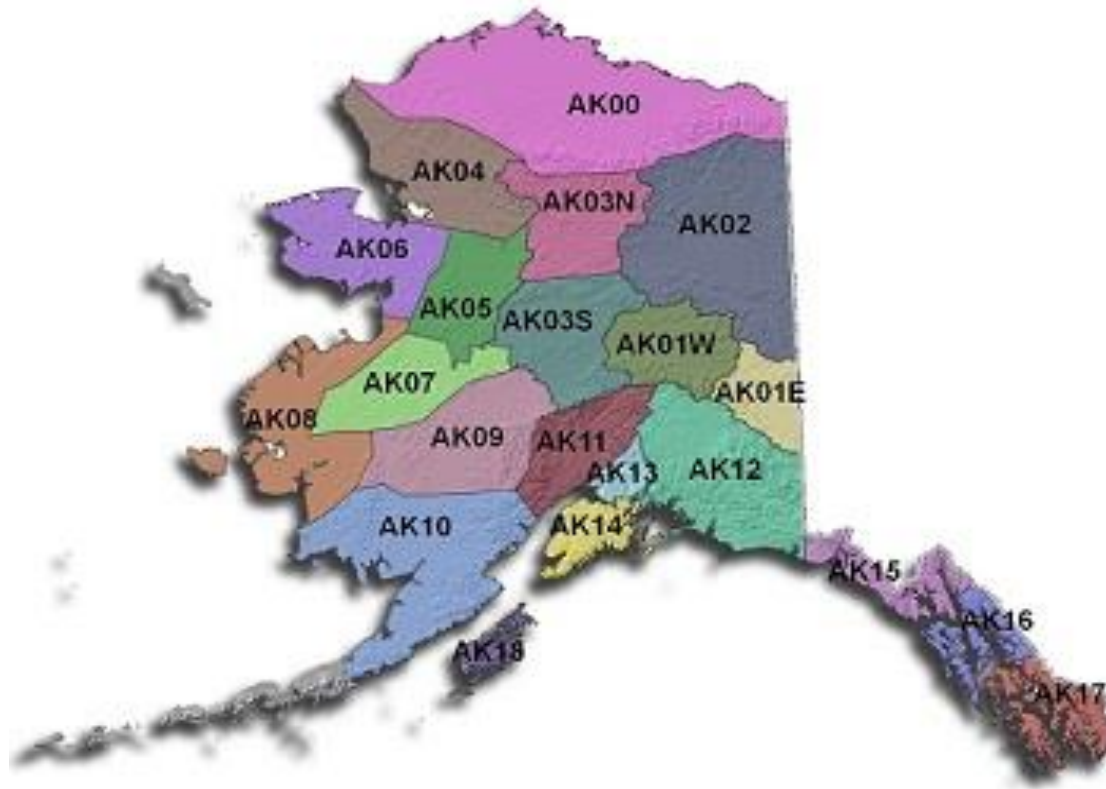
Figure 4 Predictive Service Areas